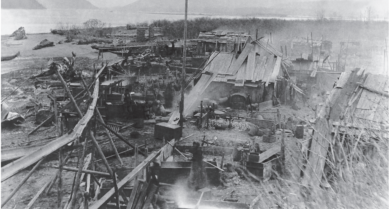
Oolichan processing at Fishery Bay, near the mouth of the Nass River. Thousands of people gathered here in February and March to make the valuable oolichan grease. Oolichan was known as the “saviour fish,” because it saved people from starvation. Its rich oil or grease is extremely nutritious and valuable; it is eaten as an accompaniment to many foods, and used as a medicine and preservative. Photo RBCM PN 1449, courtesy of the Royal BC Museum and Archives

Most First Nations on the coast followed similar seasonal patterns, or seasonal rounds, when they moved from location to location as the resources became available. Winters were spent in large villages of as many as thirty cedar longhouses lined up in one or two rows facing the ocean. Feasts, potlatches, and winter ceremonies occupied much of the time spent here.