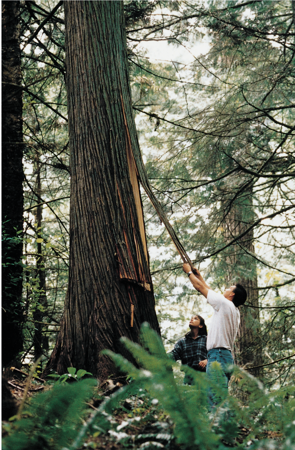
Skill, knowledge, and respect are required to harvest cedar bark from the coastal rainforests.