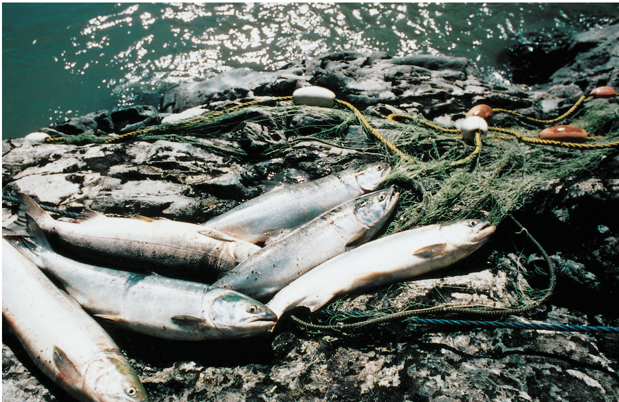
The Pacific salmon is a key resource in British Columbia. There are five species: sockeye, coho, spring, chum, and pink. The salmon is hatched in the freshwater rivers and streams of the province, makes its way to the ocean where it spends its adult life, then returns to the fresh water to spawn, and complete the cycle.

The southern coast, the region that surrounds Georgia Strait, has a different climate and therefore a unique environment. This area lies in the rain shadow of Vancouver Island, including southeast Vancouver Island, the Gulf Islands, and the Fraser Valley. Generally it has flatter land and a drier climate, and, consequently, different vegetation.