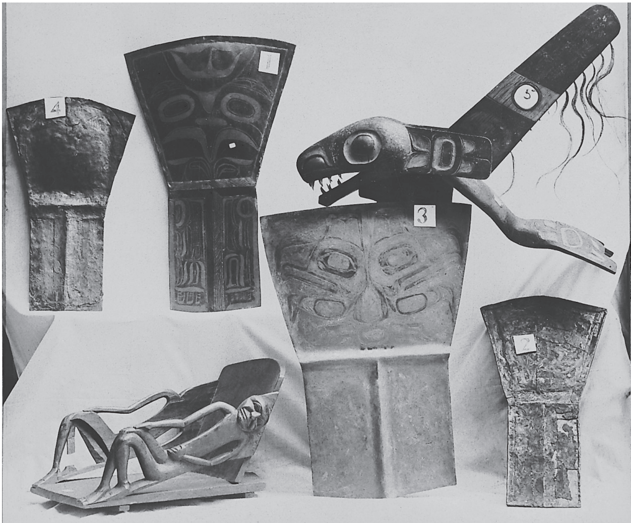
Copper was the key symbol of wealth on the Northwest Coast. Shield-like objects called coppers, seen here in objects 1-4, were originally hammered out of copper nuggets. Later they were made from copper sheets manufactured in Europe.

The Tlingit, who live on the Alaskan panhandle, were the intermediaries in the copper trade along the coast. The ore is called native copper because it can be taken out of the ground and used without being processed. It was used to decorate carvings such as masks. However, its most important use was for the large shield-like objects called coppers. These were the ultimate symbol of wealth for the Northwest Coast tribes. They were displayed and given away at potlatches.