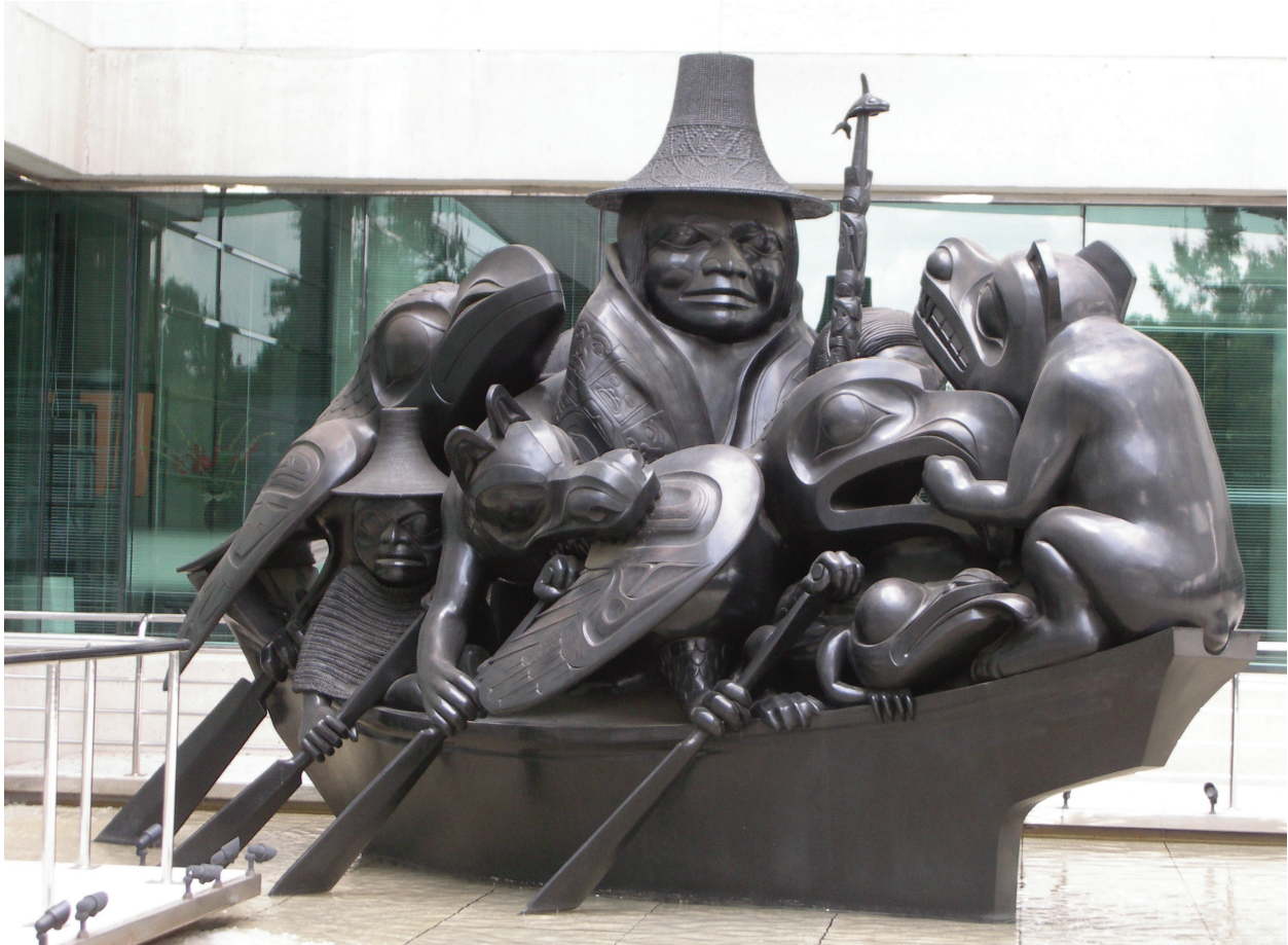
"The Spirit of Haida Gwaii" by Bill Reid. Image in the public domain

The monumental bronze sculpture of a canoe carrying 13 figures, called The Spirit of Haida Gwaii, is another symbol of northwest coast culture created by Bill Reid. The sculpture, cast in 1991, is now housed in the lobby of the Canadian Embassy in Washington, D.C., U.S.A. The sculpture weighs almost 5000 kilograms and is considered Bill Reid's master work. The Embassy's architect had invited Bill Reid to create a dynamic piece of art to balance the building's classic style.